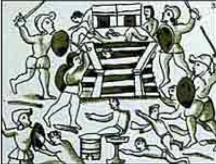
Spaniards assaulting a temple in Mexico