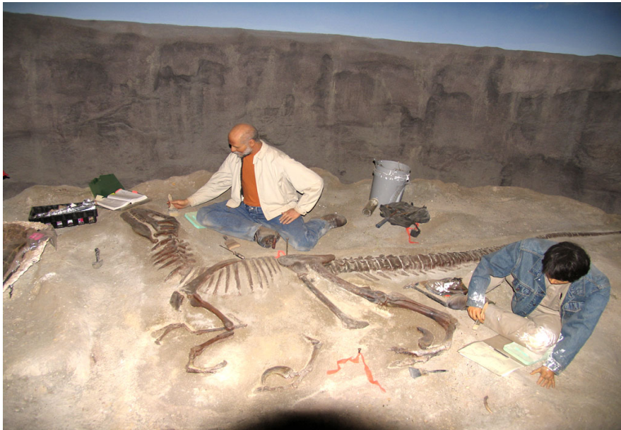
“New dinosaur fossils found!”

3) Which social scientists most likely played an active role in the above finding? _____